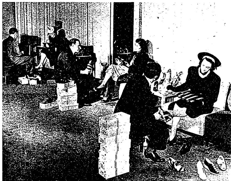
Footgear for the eternal feminine.—Fitting sandals in ancient Greece and trying on shoes in a modern store.