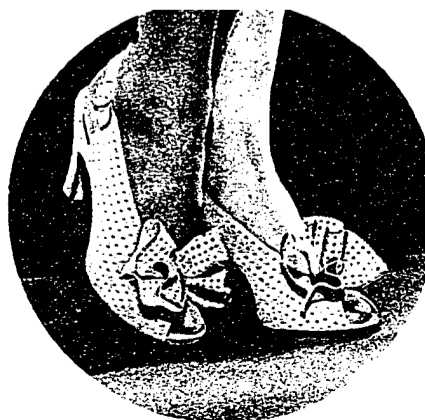
2. Open toe.

Nor was this the end of masculine whimsy in footgear. The cavaliers of the English Commonwealth swaggered around in boots with such enormously wide cuffs that only bow-legged men could walk at a normal speed without falling on their faces. This, however, was the end. Ex-