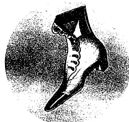
A 1900 style—High-buttoned boot.

The male who smiles condescendingly at the sight of open sandals decorated with bells or flowers might be a little sobered to know that men started the whole thing, but that is the fact. One of the earliest "novelties" to hit the boot trade was a gaudy sandal, worn by Egyptian men and later by women, which had a small figure of an enemy captive painted on the inner sole. Men also were sponsors of the first platform soles. Athenian actors wore